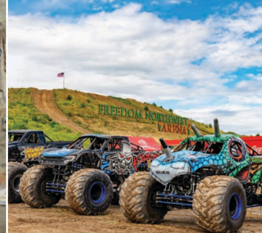
EC Motorsports Park