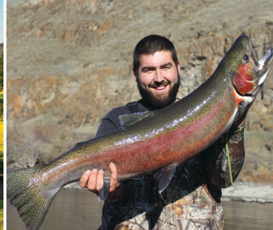
Fishing on the Snake River