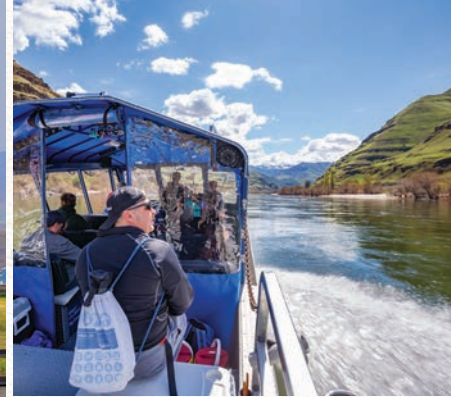
Hells Canyon Jet Boat Tour