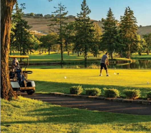
Red Wolf Golf Club