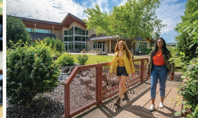
Lewis and Clark Discovery Center