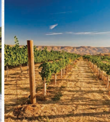
Clearwater Canyon Cellars