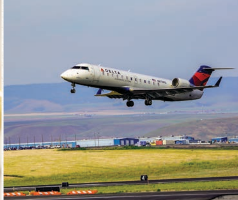
Lewiston - Nez Perce County Regional Airport