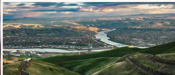
Pictured Top Left to Right: Petroglyphs in Hells Canyon, Clearwater Canyon Cellars. Nez Perce Tourism. Bottom Left: View of the Lewis Clark Valley from the Lewiston Hill.