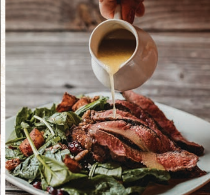
Brava's Homemade Fare