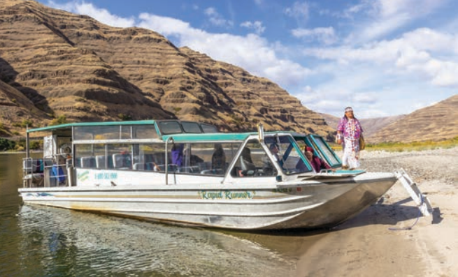
Snake Dancer Excursions & Nez Perce Tourism