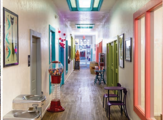
Inside Newberry Square