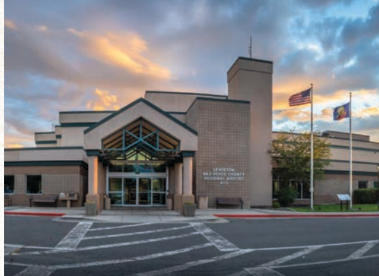
Lewiston - Nez Perce County Regional Airport