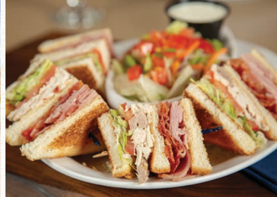
Strike & Spare Bar and Grill