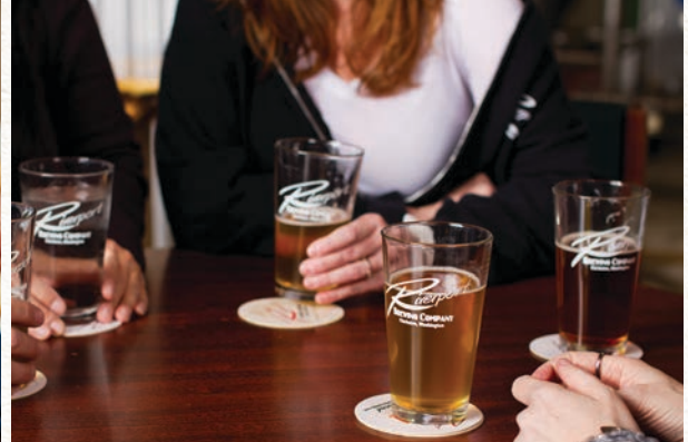
Riverport Brewing Company