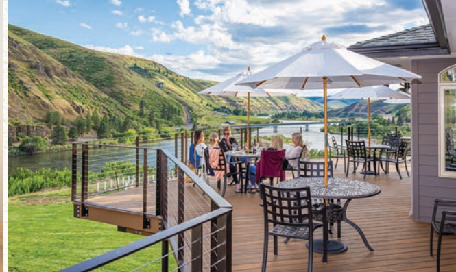
Rivaura Estate Vineyards Tasting Room